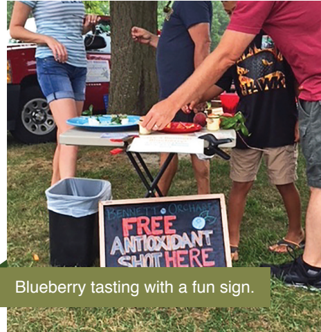
Blueberry tasting with a fun sign.

Because the results of our experiments with loyalty cards were not consistent, we think more research on this would be helpful.