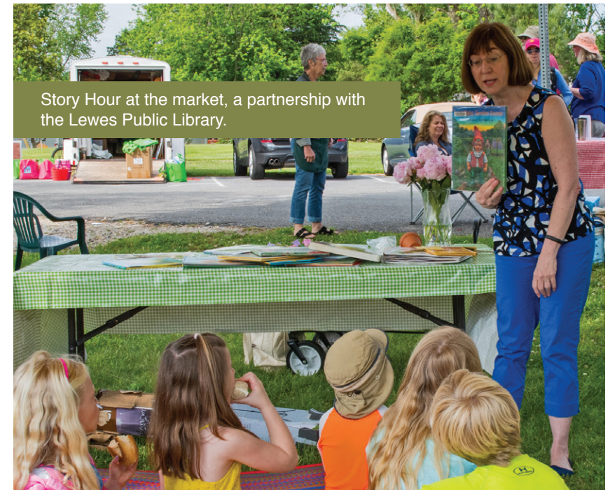
Story Hour at the market, a partnership with the Lewes Public Library.

On Health Day, our partner Beebe Healthcare (a major provider of hospital and outpatient care services in our county), provided free diabetes and blood pressure screenings, and gave a talk and demo about heart-healthy cooking. The services provided were very helpful to our customers. In fact, approximately 25% of those screened had elevated levels on one of the tests. For Mother's Day, our planned theme was "Spice Up Mother's Day", and we hoped to feature potted herbs and spices and special flower bouquets that incorporated fresh herbs, along with a Market Pairings demo on making a simple breakfast for Mom.