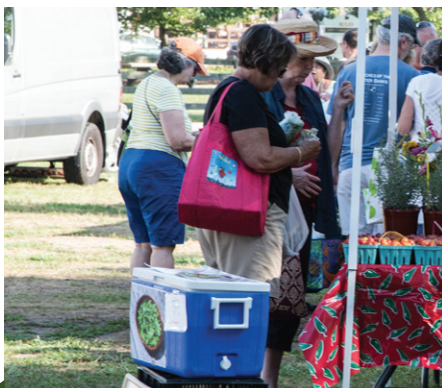
Adding a photo of the arugula inside to the front of the cooler increased sales.

We tried several different kinds of product photos, although we did not test which type was most effective. For example, when preparing photos of meat, we took photos of raw product (such as raw sausage) photos of prepared product (such as cooked sausage) and creative or “whimsical” photos (such